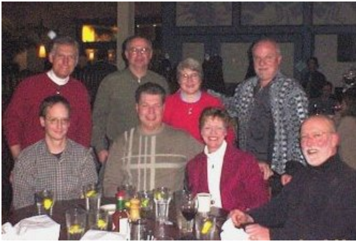
Holiday gathering Jan. 8 at The Columbus Fish Market